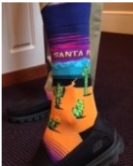
Who went to Santa Fe recently and came back with these fancy socks?

"Now the Lord is the Spirit, and where the Spirit of the Lord is, there is freedom." 2 Cor 3:17